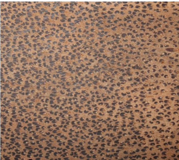
Fig.3 Digital Image of Woo Coconut Sample

Image Acquisition Preparation, the coconut wood sample was then acquired by digital image on the cross-sectional side using a digital camera. Shooting using close up mode at a distance of 13 cm and lighting using camera flash, all digital image used has the same pixel size 1700px x 1700px.