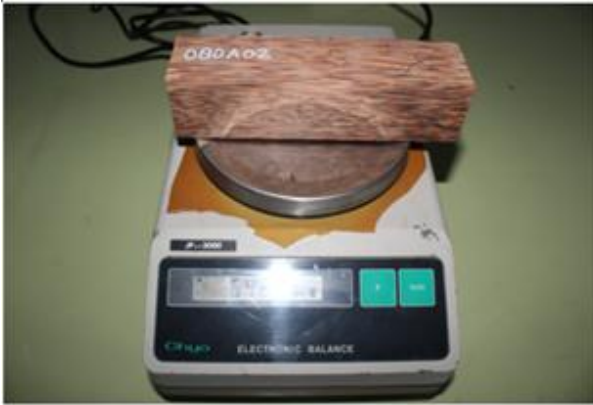
Fig. 2 Coconut Wood Samples

Image Acquisition Preparation, the coconut wood sample was then acquired by digital image on the cross-sectional side using a digital camera. Shooting using close up mode at a distance of 13 cm and lighting using camera flash, all digital image used has the same pixel size 1700px x 1700px.