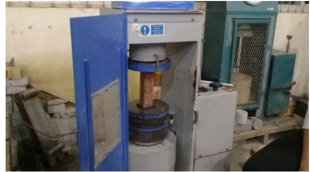
Fig.5 Compressive Strength Test

This test is carried out on the physical sample of coconut wood as shown in figure 5. by giving a load to get the maximum limit of the ability of the sample to withstand the given load