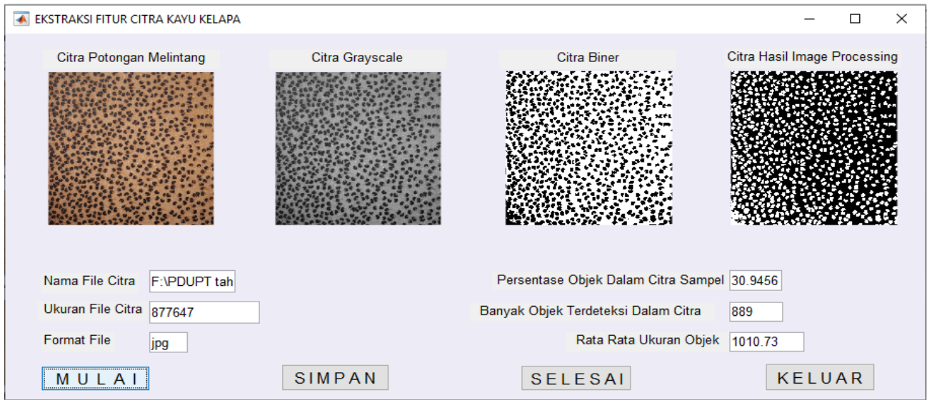
Fig. 7 Image measurement

Image Measurement Software using threshold value T=0,4 and dimension of digital image sample 1700px X 1700px, measuring process as shown in Figure 7.