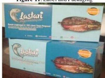
Figure 11. Label and Packaging