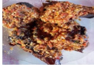
Figure 17. Cakalang Fufu Rica-Rica