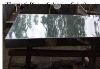
Figure 6. Place of cleaning fish after