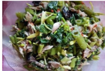
Figure 19. Sayur Kangkung Tumis Cakalang Fufu

Moreover, the recipes have been tested by the PPPUD team in 2 times. These recipes have also been translated into Japanese. These recipes will be included in the paper and plastic package, thus consumers can process the Smoked Fish (Cakalang Fufu) properly. The recipe test activities can be seen in the following figure: