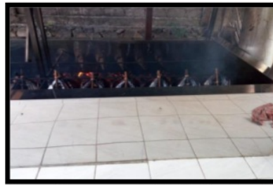
Figure 4. Improvement of Production Capacity