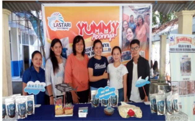
Figure 22. The activities of product exhibition of Abon Cakalang by Group of Students Rama Lingkungan

Abon Cakalang cooking recipes used by students have been taught to Lastari SMEs. The existence of a potential market from the sale of Abon Cakalang which is shown from the results of the students' business activities. Therefore, the proposal of product license (P-IRT) can be carried out simultaneously at a lower cost. Thus, business diversification for Lastari SMEs in the future is: Abon Cakalang.