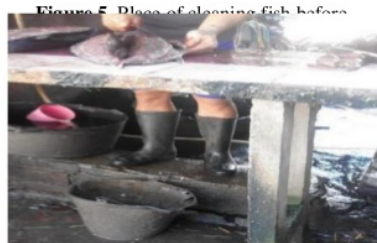
Figure 5. Place of cleaning fish before

Lastari SMEs has not paid attention to the place of production process and therefore, it has not been arranged clean and neat. Community service activities with the PPPUD scheme have provided solutions, especially in the arrangement of a cleaner and tidy place for the production process (fish cleaning). The production place become cleaner and tidy as follows: