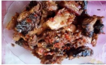
Figure 16. Cakalang Fufu Pampis