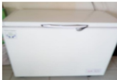
Figure 10. Improvement of Storage Capacity of Laiya SMEs