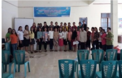
Figure 14. Workshop activities of