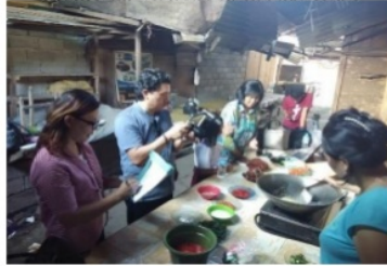
Figure 20. Activity of Recipe Test I