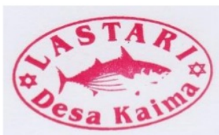
Figure 13. Stamp of Lastari SMEs