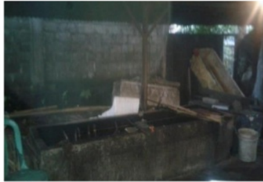
Figure 3. Place of smoked fish production before PPPUD activities