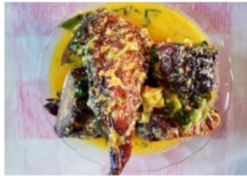
Figure 18. Cakalang Fufu Pampis