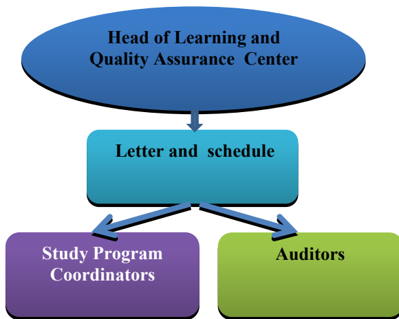
Fig. 2. Pre-audit processes.

Before the internal quality audit is carried out, based on existing procedures, the Head of Center makes an audit letter and an audit schedule for conducting an internal quality audit and submits it to the study program coordinator. Furthermore, the Head of Center makes the auditor's assignment letter and submits it to the auditors together with the schedule for conducting the internal quality audit. The auditors whose task is to audit the study program must be different from the origin of the auditor's study program. The auditors must contact study program coordinators for meeting appointment. In summary the pre-audit process is described in Fig. 2.