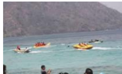
Figure 7. Water sport in Pal Beach