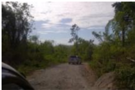
Figure 8. Access Road to Pal Beach

The entrance to Pal beach area is still inadequate, despite being paved with paving standards. But in a few months later, it is found a lot of broken asphalt resulting in holley and rocky road (Fig. 8). This is an obstacle for visitors who have a desire to enjoy the beauty of the Pal beach. Many visitors complained reasonably about access to the Pal beach which is 2.5 km from the village. During holiday season and national holidays, Pal beach is crowded causing long traffic jam when you enter Pal beach area. It is also the cause of the declining number of visitors who come to the Pal beach.