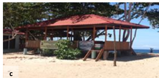
Figure 10. Gazebo in Pal Beach. a) small gazebo, b) medium gazebo, c) large gazebo.