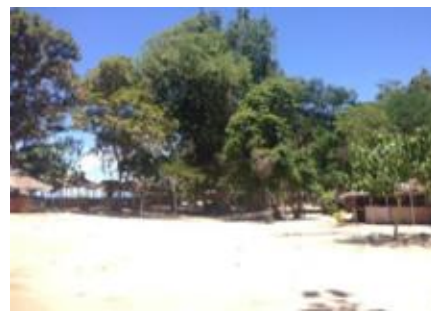
Figure 9. Parking Area in Pal Beach

Pal beach area has a spacious parking area so that the visitors do not need to wonder around to get a parking spot as shown in the Figure 9. In Pal coastal resort, there are a number of gazebo with three sizes: large, medium and small built by the government of North Minahasa Regency. This gazebo (Fig. 10), besides used as a family resting place, is also used for Christians worship places who do beach tourism worship. Gazebos for rent with various prices, as in Table 2.