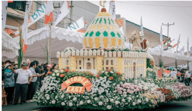
Figure1. Participants from the Middle East (2024)